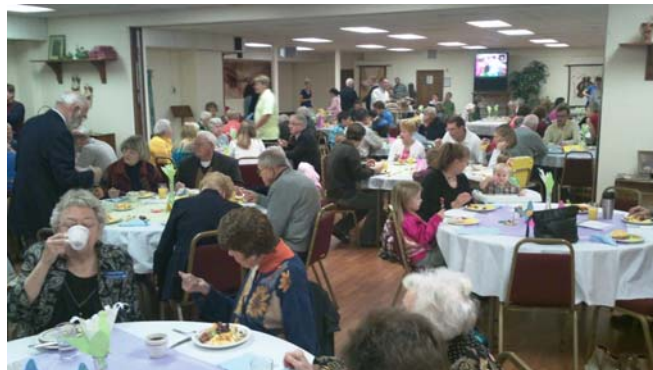
All-Church Brunch April 17 Raised just over $540 for Camp Scholarships

← Scenes from this year’s Vacation Bible School